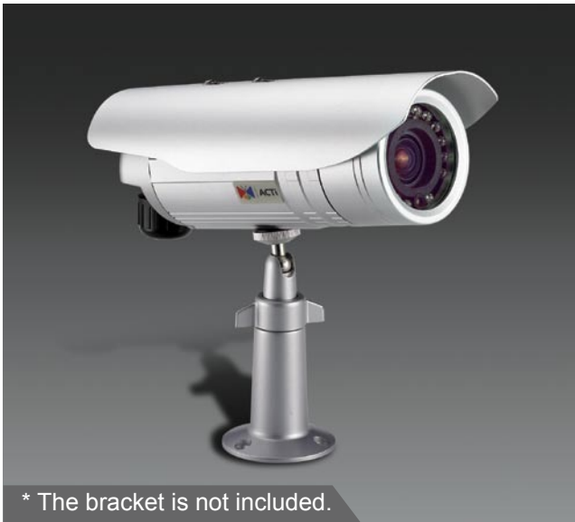
* The bracket is not included.